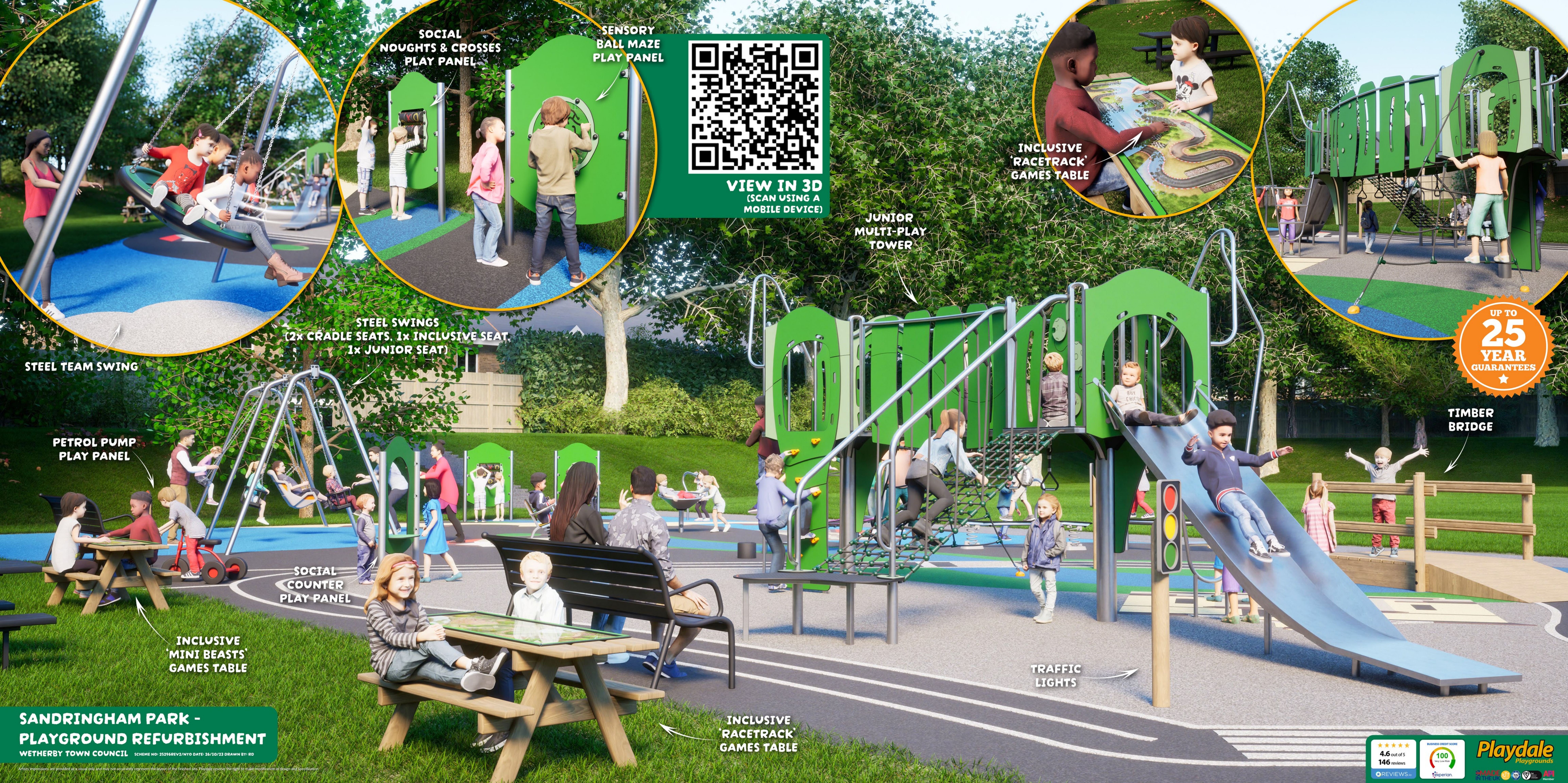
STEEL TEAM SWING