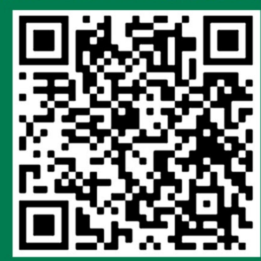
VIEW IN 3D (SCAN USING A MOBILE DEVICE)